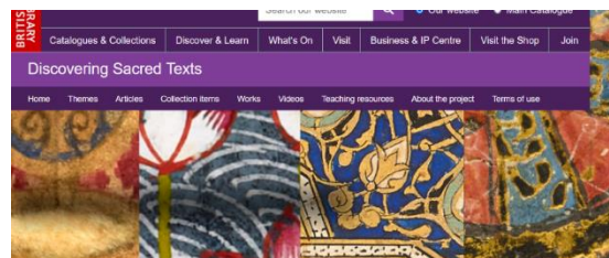
Discovering Sacred Texts: Key Stage 2 teaching resources

Bring sacred texts to the classroom with these fascinating resources from the British Library. The resource covers Hinduism, Buddhism, Sikhi, Judaism, Christianity and Islam. Find out more here: https://www.bl.uk/sacred-texts/activities/key-stage-2-teaching-resources